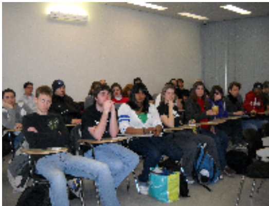
Above, presenters and participants in Multi-Faith 2010

period involving all the students. Over 50 students participated in Multi-Faith Fair 2010. It was a provocative and vibrant time.