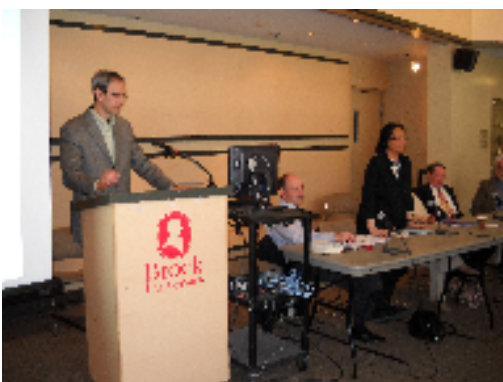
From World Religions Conference 2010