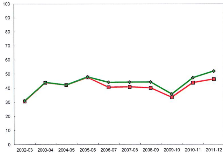
Legend: Fall/Winter (red square), Total (green diamond)