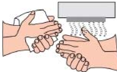
5. Towel or air dry hands