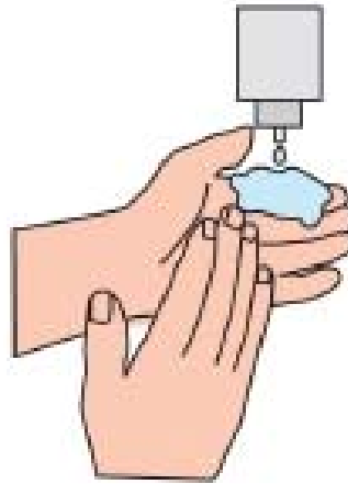
2. Use liquid soap