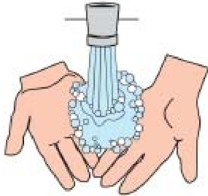
1. Wet hands